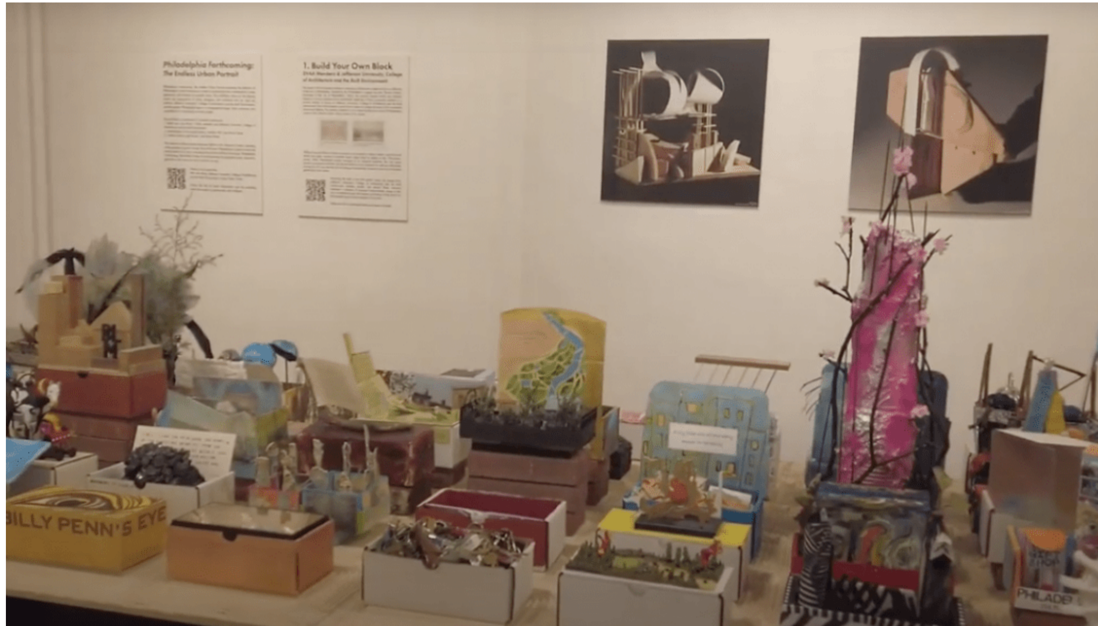
The "Build Your Block" section of Philadelphia Fortcoming .